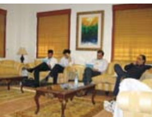
Participants at the seminar

defines the first stage of colonialism as 'first of all overcome resistance, smash the framework, subdue, terrorize. Only then will the economic system be put in place'. In this new system, the colonist acts as both the supplier of raw material as well as the consumer of goods imported from the metropolitan. Thus the colonized is systematically pauperized as he only acts as the provider of cheap labour and not even that after mechanization of economy. A similar situation also occurs on the social front as colonialism comes with the ideology of racial and civilizational hierarchy which is eventually internalized by the colonized. Memmi argues that 'colonization distorts relationships, destroys or petrifies institutions, and corrupts men, both colonizers and colonized'. Thus Tricontinental thinkers as opposed to Gandhi and the negritude movement argue that it is not possible to move back to native organizational structures after the colonial experience. Instead a new humanism is needed to surpass both the closed past and the de-humanizing present.