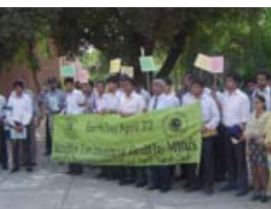
Earth Day Walk at F. C. College