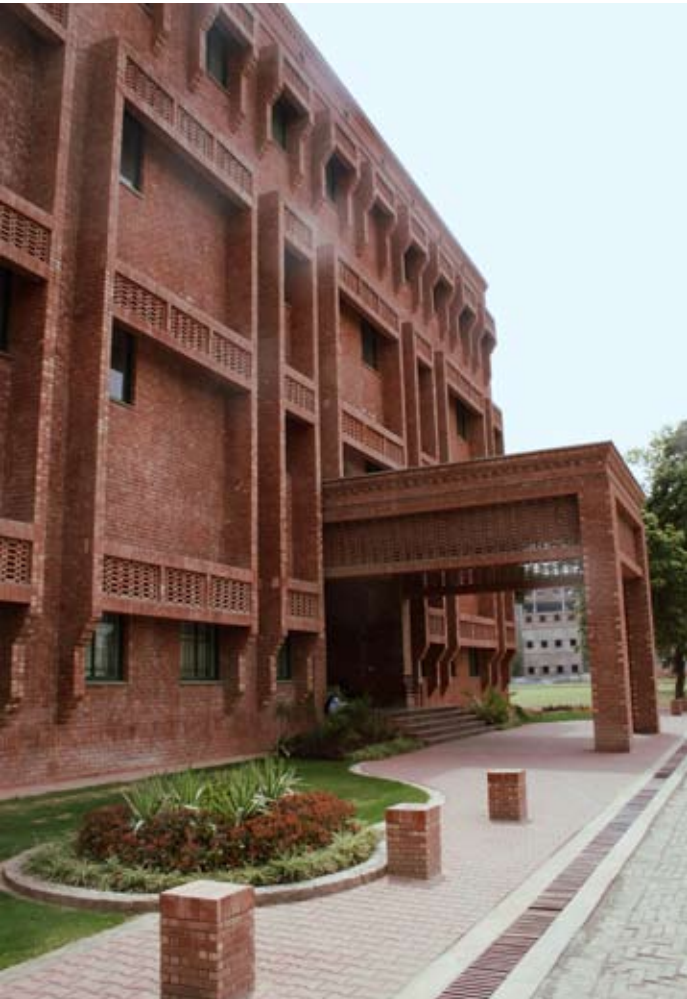
CPPG: E-017 & 018